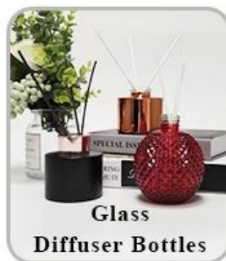
Glass Diffuser Bottles