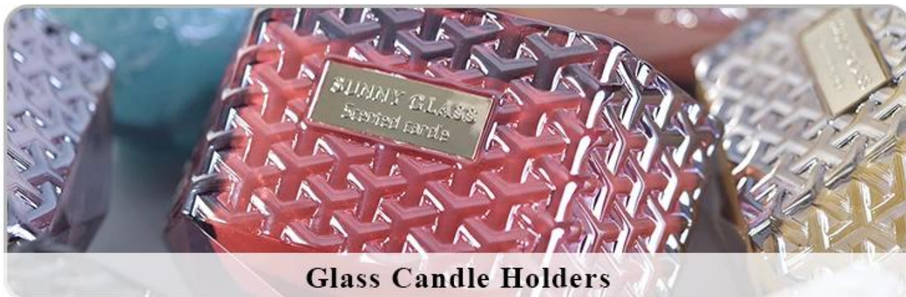
Glass Candle Holders