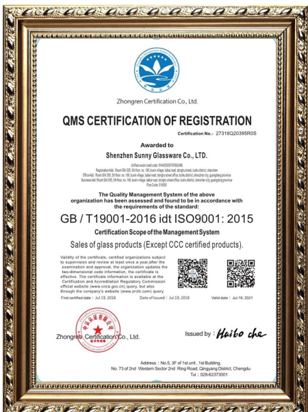
ISO 9001: 2015