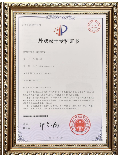
Patent no.: 20163065323.4