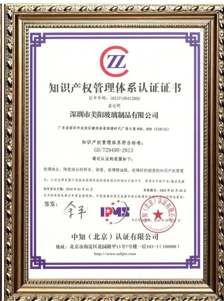
Corporate intellectual property