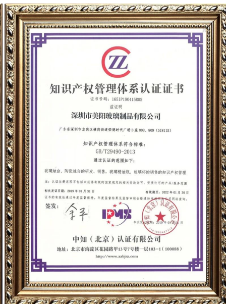
Corporate intellectual property