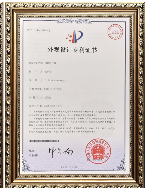
Patent no.: 20163065323.4