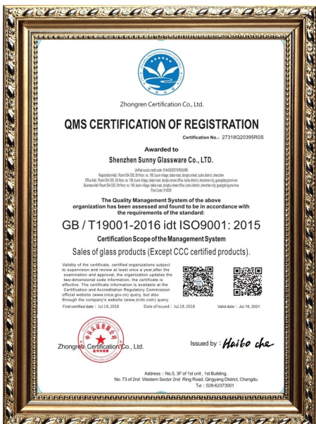
ISO 9001: 2015