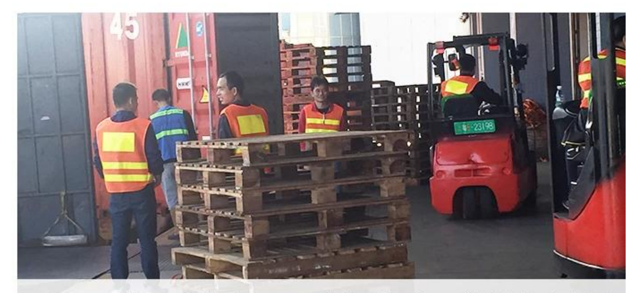
Own professional shipping company( Shenzhen Sunny Worldwide logistics)