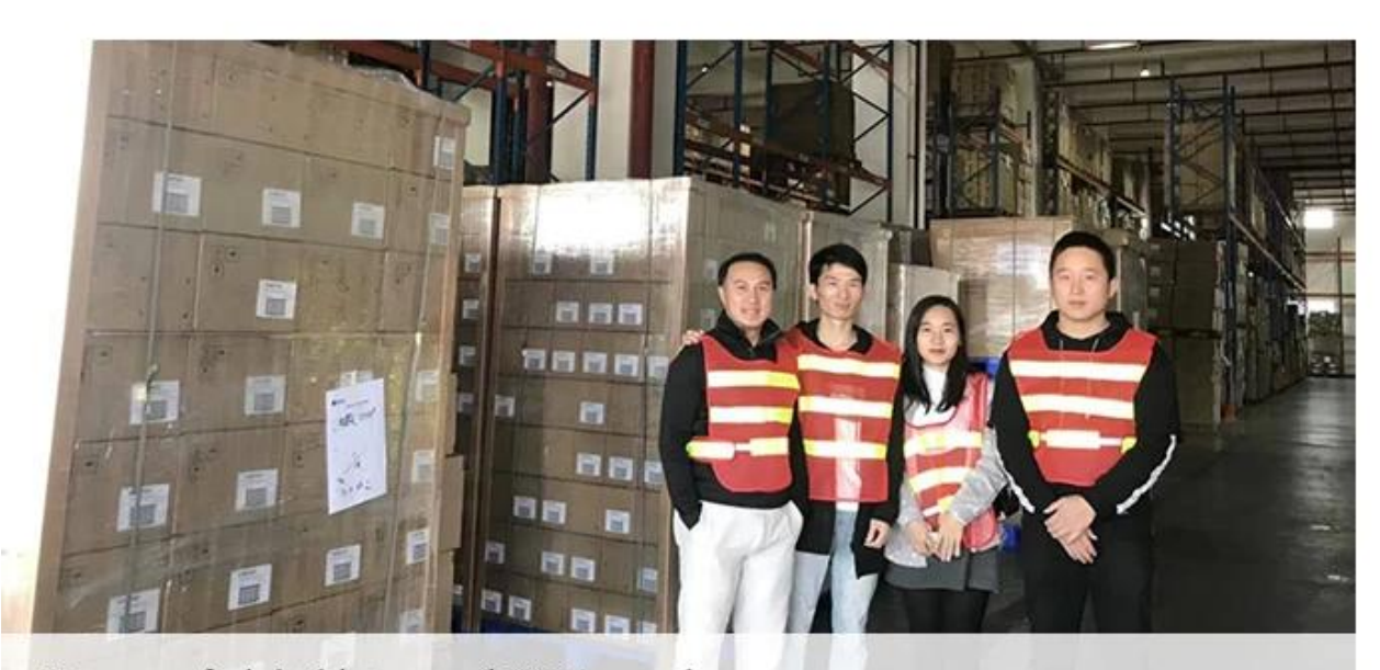
20+ years freight history and WCA members.