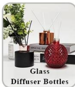
Glass Diffuser Bottles