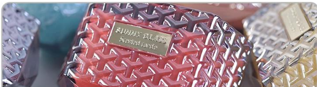
Glass Candle Holders