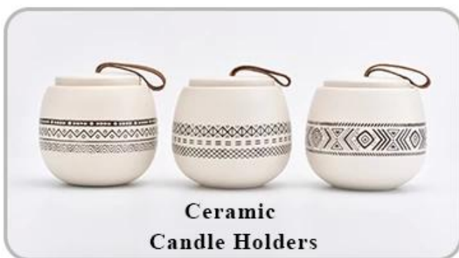
Ceramic Candle Holders