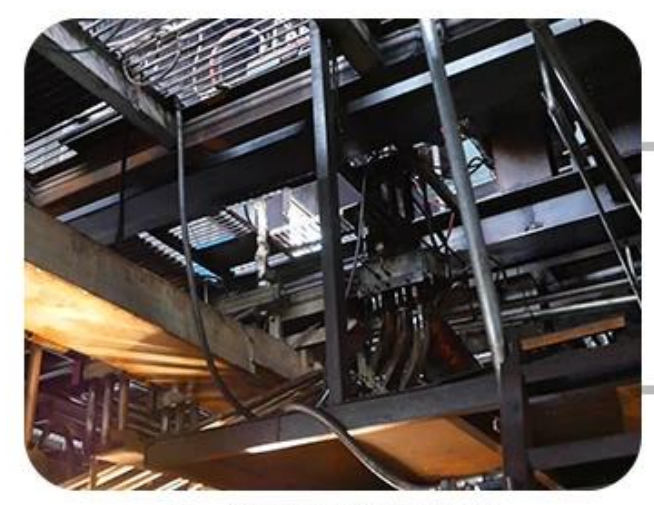
1. Material Cutting