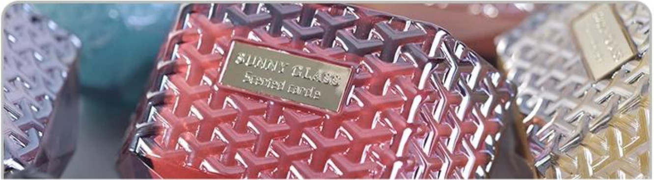
Glass Candle Holders