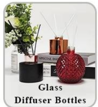
Glass Diffuser Bottles