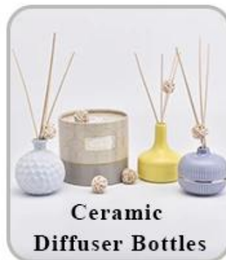
Ceramic Diffuser Bottles