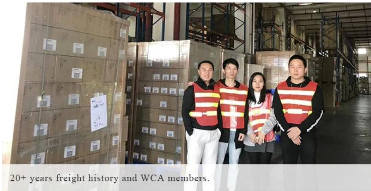
20+ years freight history and WCA members.