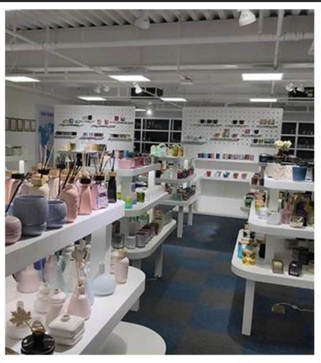
There are more than 5000 products in sample room of Sunny Glassware for your reference.