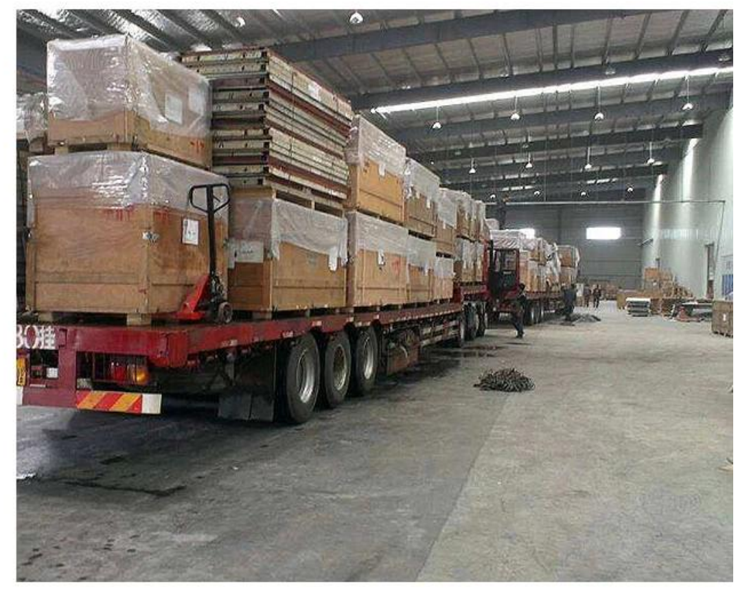
Own professional shipping company(Shenzhen Sunny Worldwide logistics)