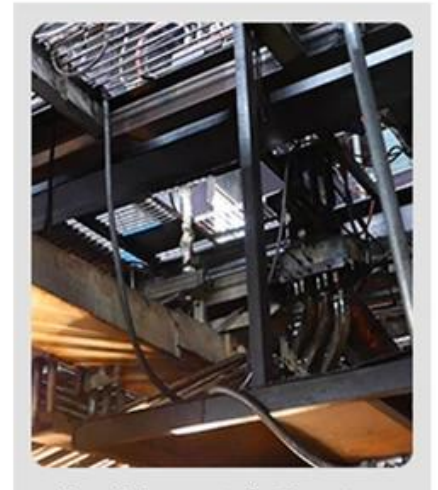
1. Material Cutting