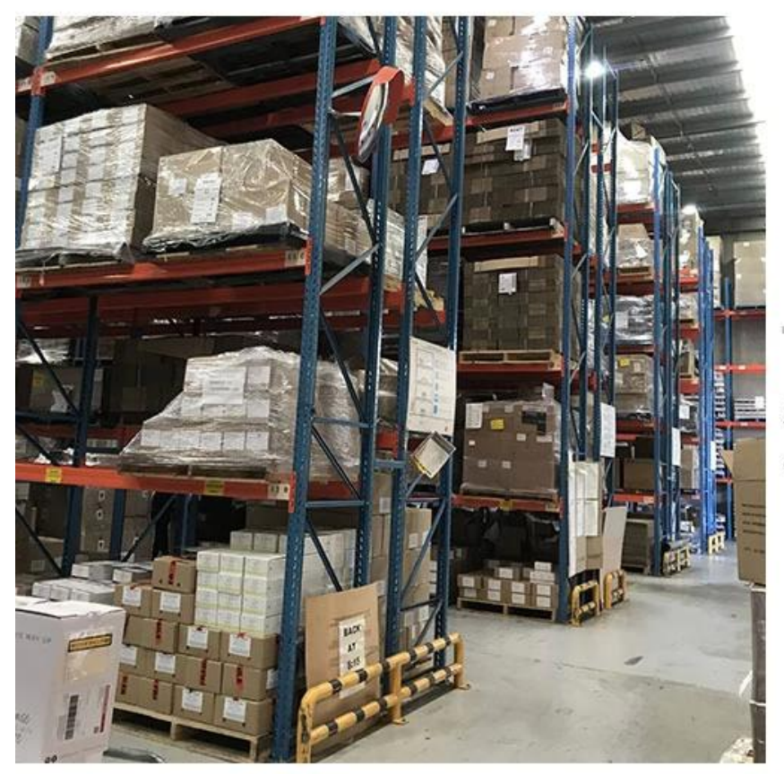
20+ years freight history and WCA members